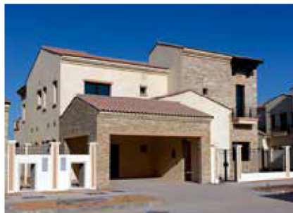
Any wall of a residential building: load bearing, interior and exterior