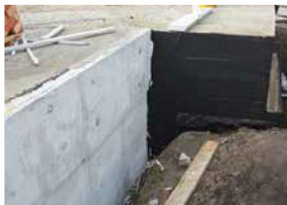
Walls located below ground level with pre-waterproofing