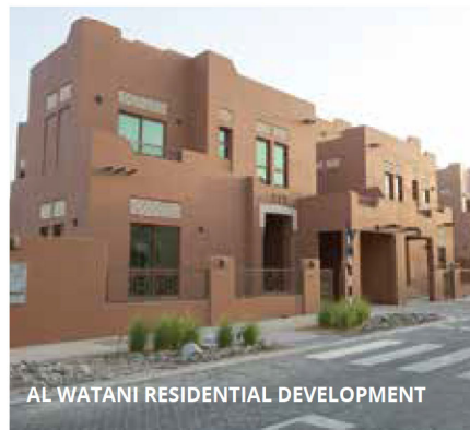
AL WATANI RESIDENTIAL DEVELOPMENT