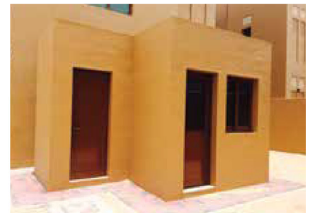
Any walls and partitions for outbuildings, as well as seasonal operation of buildings