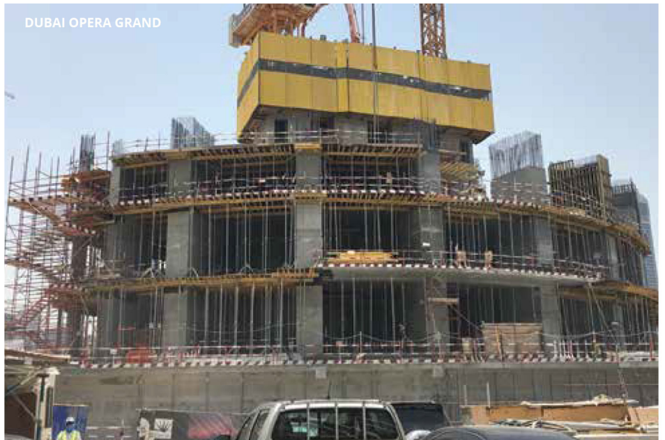
DUBAI OPERA GRAND