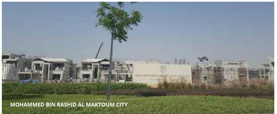
MOHAMMED BIN RASHID AL MAKTOUM CITY