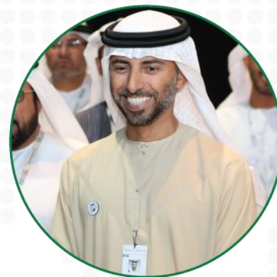
H.E. Eng. Suhail Mohamed Faraj Al Mazrouei Minister of Energy and Industry, UAE