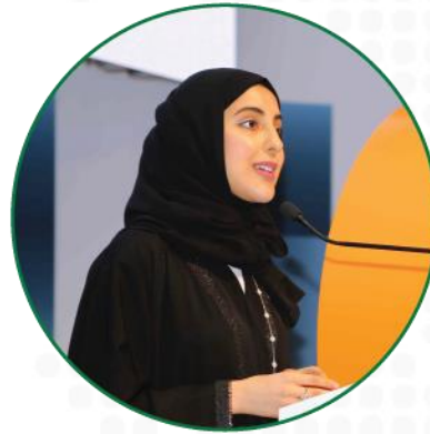
H.E. Shamma bint Suhail bin Faris Al Mazrui Minister of State for Youth Affairs, UAE