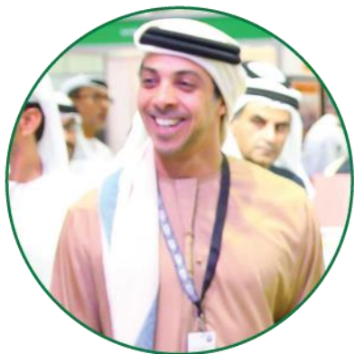
H.H. Sheikh Mansour bin Zayed Al Nahyan Deputy Prime Minister and Minister of Presidential Affairs, UAE