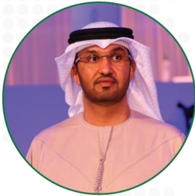
H.E. Dr. Sultan Ahmed Al Jaber UAE Minister of State and Chairman of Masdar