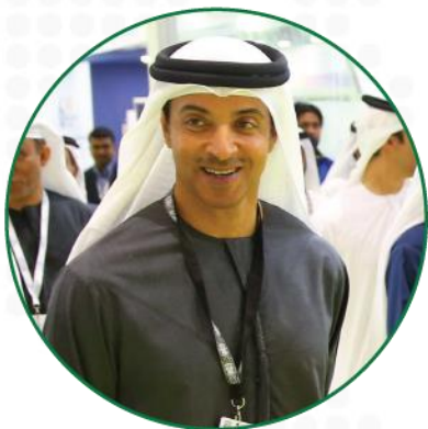
H.H. Sheikh Hazza bin Zayed Al Nahyan Vice Chairman of the Abu Dhabi Executive Council