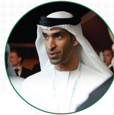
H.E. Dr. Thani bin Ahmed Al-Zeyoudi Minister of Climate Change and Environment, UAE