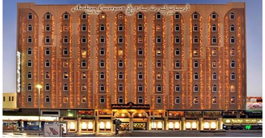
SMART4POWER LLC ARABIAN COURTYARD HOTEL

Arabian Courtyard is a hotel with 173 rooms situated near the iconic Dubai Museum. The annual Electricity consumption was 4.96 million-kilowatt hour which equates to 2.18 million AED. Smart4Power guaranteed savings of up to 20%. The investment, implementation and operation of different energy conservation measures at the hotel targeting HVAC, lighting and water consumption helped reduce the annual