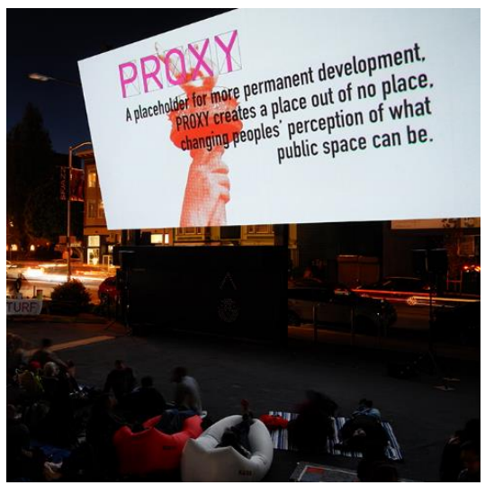
Figure 1, Using vacant spaces to create spaces fpr social interaction adds life to the community

Thoughtfulness: community plays a vital role in giving on a sense of belonging and support. Being part of a community also gives one a sense of purpose and fulfilment which enhances happiness.