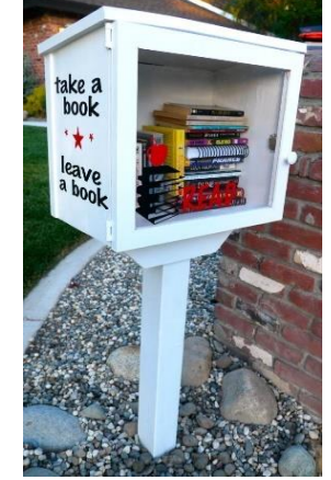
Figure 2. Take a book/Leave a book campaign engages with the community

Inclusivity and Play: Children are a good indicator of happiness. Designing child-friendly spaces can facilitate growth of a happier community as a city which caters for children caters for all and inclusion is important for a happy society.