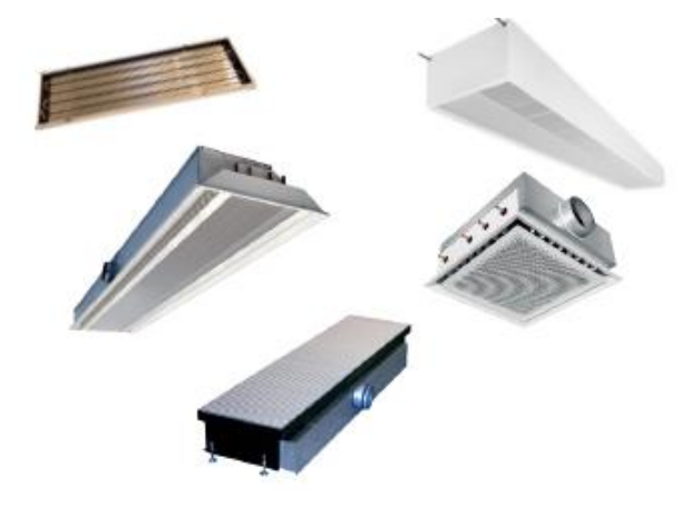
Figure 1 : Chilled Beam Systems